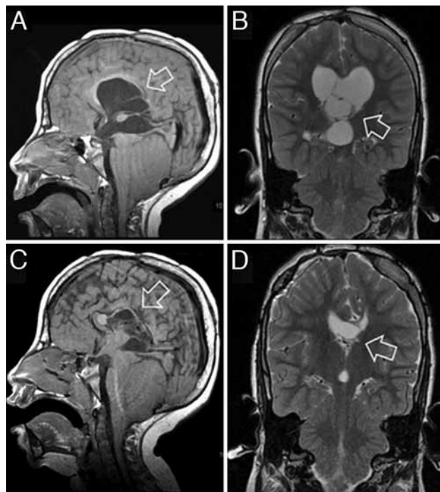
Fig. 1. Magnetic resonance images obtained before (A–B) and after (C–D) surgery. Sagittal T1-weighted (A) and coronal T2-weighted (B) images showing cystic dilation of the third ventricle. Herniation of the cerebellar tonsils below the foramen magnum is also visible on the sagittal scan (A). Follow-up sagittal T1-weighted (C) and coronal T2-weighted (D) MR images disclosing a marked reduction in the cystic dilation of the third ventricle. Herniation of the cerebellar tonsils below the foramen magnum is still evident on the sagittal scan (C). Arrow points to dilation of the third ventricle in each panel.

Postoperative Course. Immediately after surgery a striking improvement in the sleep-related respiratory pattern was observed. In particular, the parents reported a consistent reduction in snoring and respiratory pauses.