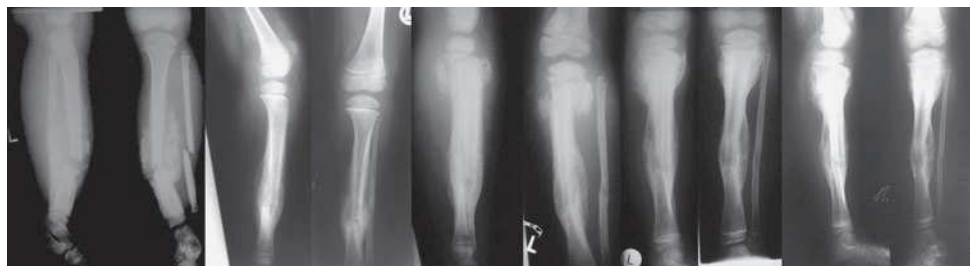
Fig. 1 This 3.5-year-old girl (neurosegmental level of lesion below L3) sustained a fracture of the left lower leg with no history of injury. Bilateral clubfoot surgery with subsequent 10-week plaster cast immobilization had been performed 11 weeks prior to the fracture.

detect possible differences in bone mineral density (BMD) z -scores between level of neurological impairment and ambulatory status. Boxplots were used to visualize the findings. Level of significance \alpha was set to 0.05.