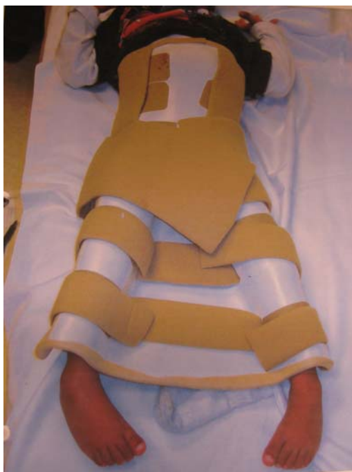
Fig. 3 Custom-molded total body splint

of this deformity with internal rotational osteotomy of the tibia should be considered when external torsion is greater than 20^\circ [40]. We use the same technique as for correcting internal torsion. In addition, it is essential to examine the patient's entire lower extremity, paying particular attention to the hindfoot, as we have noticed a correlation between external tibial torsion and hindfoot valgus. Often, both deformities require treatment in order to achieve a successful result. Treatment of the hindfoot valgus consists of a medial sliding osteotomy of the os calcis.